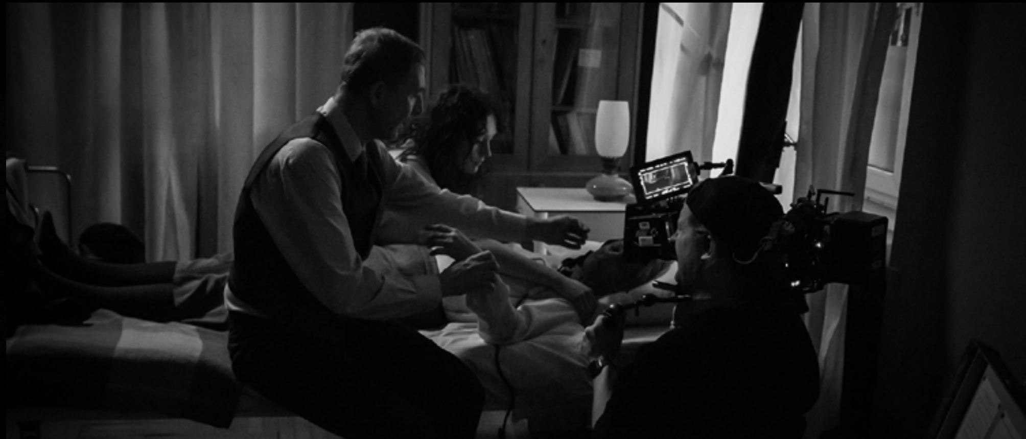
Director of Photography Michał Długołęcki hunts for the perfect shot in a hospital ward scene.

More hi-res BTS photos available on Google Drive